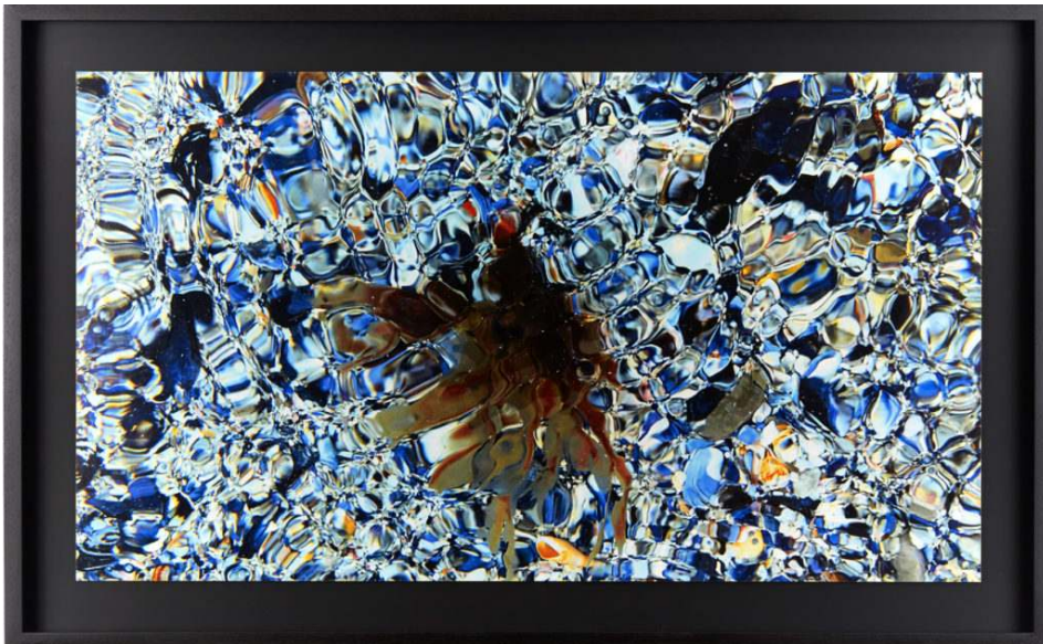
SaySay.Love, AFLOAT , 2017, Archival inkjet print on hahnemuhle baryta paper, 61cm x 108cm. ©SaySay.Love

Water-wise education and calls by government have already decreased consumption from 1,1 billion litres per day in January 2016 to 582 million litres per day today. However, as impressive a feat as this, Cape Town is still not yet in the clear.