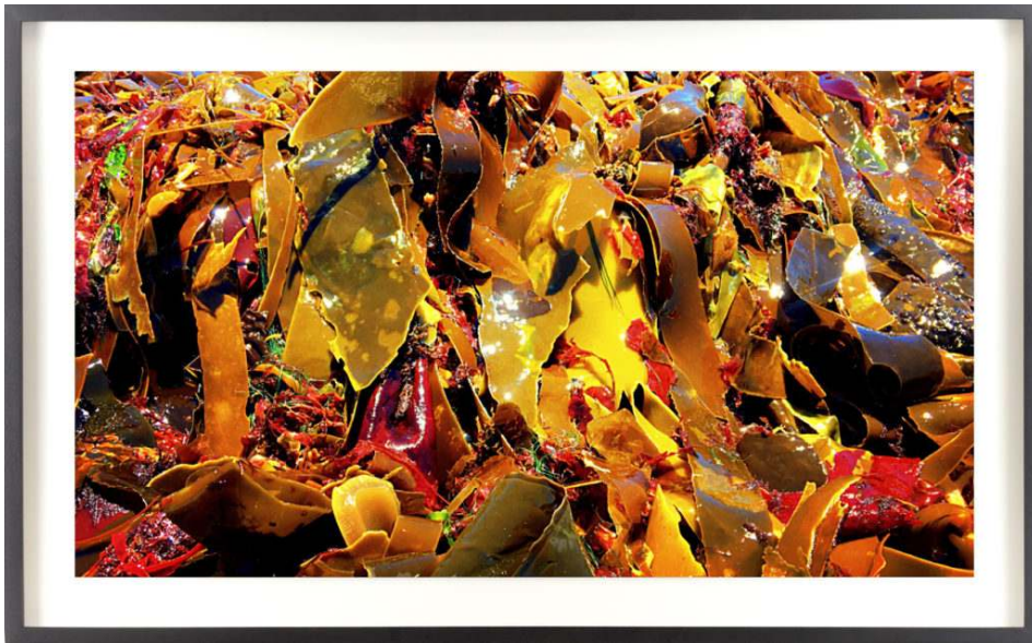
SaySay.Love, FRANTIC , 2017, Archival Inkjet print on hahnemuhle baryta paper, 61cm x 108cm. ©SaySay.Love

SaySay hopes that by seeing this unique artwork on a daily basis, city officials will be reminded of the beauty that is Water and how valuable the work is that has been undertaken by the city to secure the water source for the future.