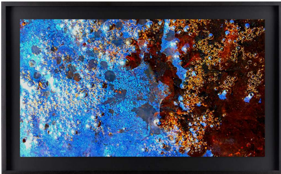
SaySay.Love, THE BLUES , 2017, Archival inkjet print on hahnemuhle baryta paper, 61cm x 108cm.

Besides inclusion in the Lalela curricula, additional programmes will also include workshops with the artist, community engagement initiatives and take-home materials that will help to educate outside the classroom and engender a spirit of family cohesion and community pride. The outcomes of the programme will include public exhibitions, community gardens and places of reflection, publishing of books (educational, inspirational, and comics).