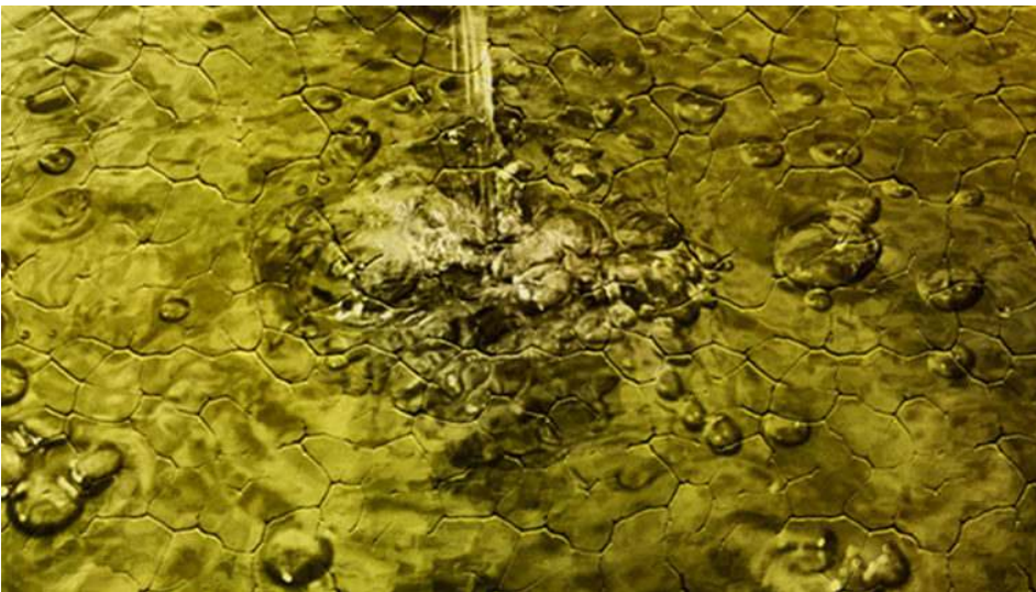
SaySay.Love, BREAK THROUGH , 2017. Lightbox, Archival Inkjet Print on Perspex, 196 x 300cm. ©SaySay.Love

Artist to donate proceeds of sale of unique artwork valued at R1million to support youth education