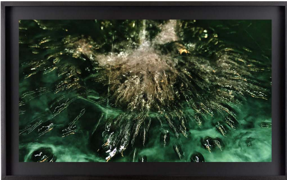
SaySay.Love, DELIGHT , 2017, Archival inkjet print on hahnemuhle baryta paper, 61cm x 108cm.